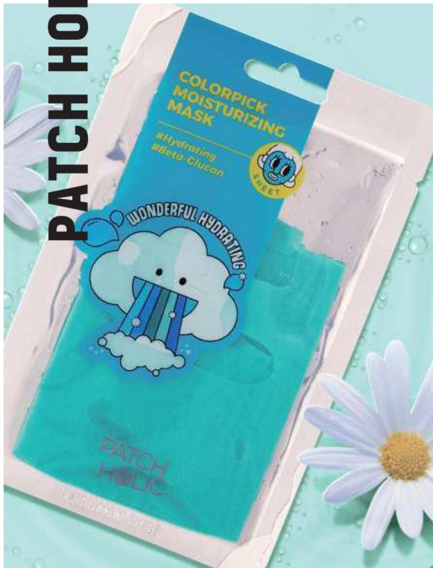
Aqua Plus + DAILY MASK